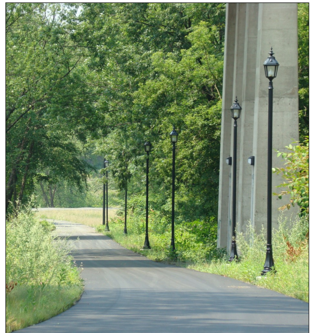
The Downtown Scranton Riverwalk under the Mulberry Street Bridge.

The Riverwalk is conveniently located close to downtown Scranton for residents, the business community, and visitors to the area. The trail has a paved asphalt surface, and it is fully accessible for wheelchairs and strollers. Since it opened in summer 2010, the trail has been popular with walkers, runners, dog-walkers, and bicyclists. A local running club routinely uses the combination Riverwalk and CNJ trail for 5K training runs and benefit races.